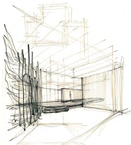
Early Spatial Concept - Residence