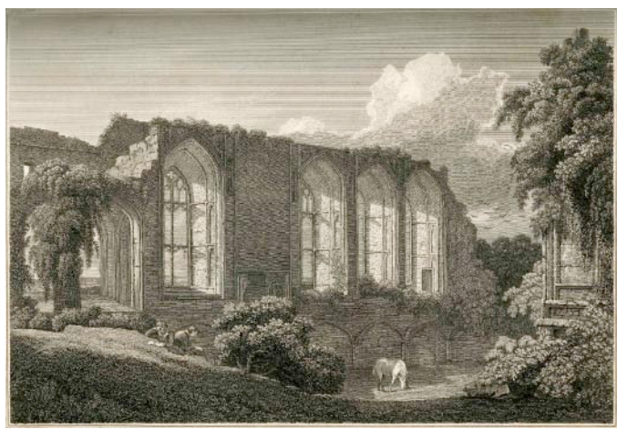
Fig. 3. John Britton, "Kenilworth Castle, Warwickshire, View of Part of Hall," The Architectural Antiquities of Great Britain (1835).

The discussion on architectural ruins has a wider application to that on architectural design that promotes participatory interpretation. Here "participatory" is used to specify the type of interpretation in which observers and inhabitants engage themselves in understanding the piece of architecture. Other architectural designs that encourage participatory interpretation may include those by Tadao Ando and Peter Zumthor, in which the observer's attention is drawn to the few carefully selected and superbly constructed forms and materials. Either through distanciation or minimalism, architecture's physical properties engage the observers and inhabitants in the participatory interpretation. Thus architecture has a way of contributing to the contemplation on the meaning of life.