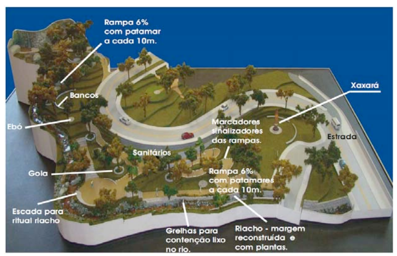
Figure 3 - Model of the Sacred Space.

Ramp with 6% level every 10 m/ benches / Ebó (spaces for 'cleaning rituals') / Tree collars / Stairs leading to creek ritual / Restrooms / grids for the containment of garbage/ Creek: margin reconstructed with plants / Markers - ramp flags / Xaxará (landmark)