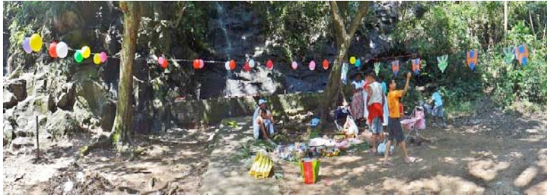
Figure 2 – Sacralized Portal and a ritualistic moment at the Tijuca National Park

Unlike the worship found in synagogues, churches and other religious temples, most African religions celebrate their rituals strictly using the natural landscape as a place of worship. Therefore, waterfalls, forests, rivers, lakes, quarries and swamps constitute a sacred environment for the communication between the worshipers and their deities.