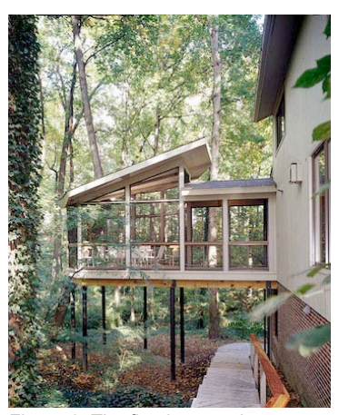
Figure 6. The floating gazebo as seen from the path to the Music School entrance is a favored spot for the family. The structure was not easy to build. However, the Builders, consummate craftsmen, still remind me what joy this was to build.