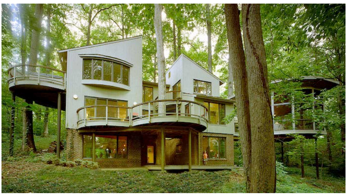
Figure 1. Rear view of the house. The curved decks create a harmonious dance with the trees. The builders and I laid out the final curves and shapes for most of the decks on site.

Lorena Checa, AIA LEED AP CHECA Architects PC, Washington DC lorena@checaarchitects.com