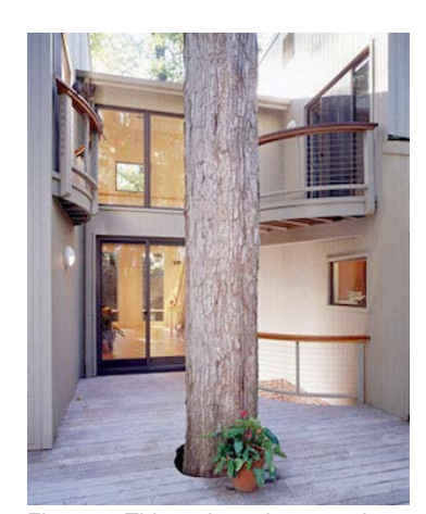
Figure 5. This major oak tree at the rear of the house was the inspiration for the copper downspout at front façade.