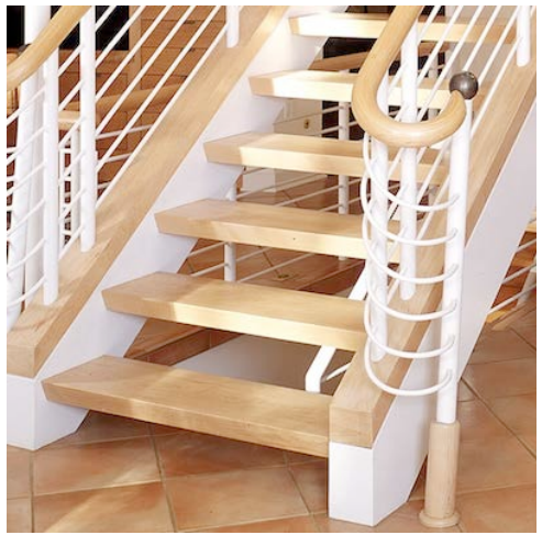
Figure 9. A newel post becomes an opportunity to celebrate the transition to ascending—with the help of the Metalworker, Woodworker, Metal Sculptor, and Stair Builder. Joe saved the day by making the end curves of the newel caps out of seventy-two laminations of maple.