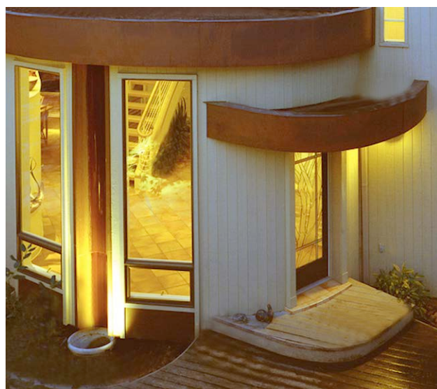
Figure 3. The owner and the Glass Artist collaborated on the design of the front door art panel. It evokes the woods that she so cherishes. Coming home every day, the care of so many hands is palpable. The curved copper parapets create an element of grace that accentuates an oversized copper scupper that channels rainwater into a small garden. The concave downspout mirrors the vertical presence of a great oak tree growing through the deck at the rear of the house forming the axis of a new circulation spine.