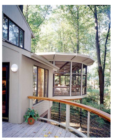
Figure 7. The gazebo as seen from the rear deck. The 12-foot high front screened openings reach out to the tall oaks and connects the user to Spirit or Higher Self.