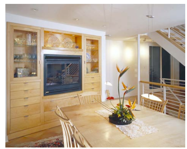
Figure 8. The Woodworker: Joe works with us on almost every project making every piece of built-in millwork a joyful collaboration and a functional work of art. For this dining room piece, he contributed two beautiful old slabs of curly maple because he saw how perfect they were for the fireplace accents.