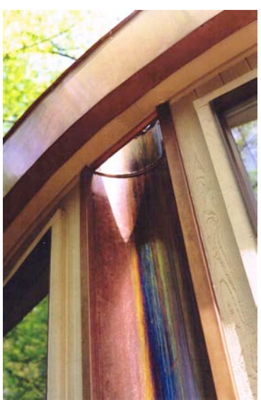
Figure 4. The Copper Roofer not only made a full size tin mock-up, but also really slowed down and enjoyed working out the details with me. He crafted sculptural elements that delighted him and all.