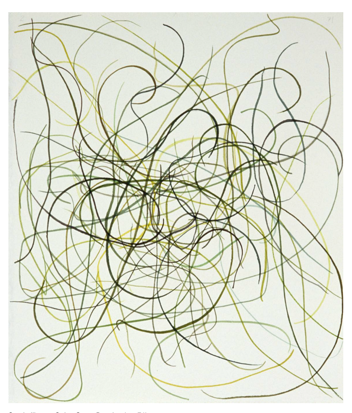
Sanda Iliescu, Onion Grass Drawing (no. 71) Watercolor on paper