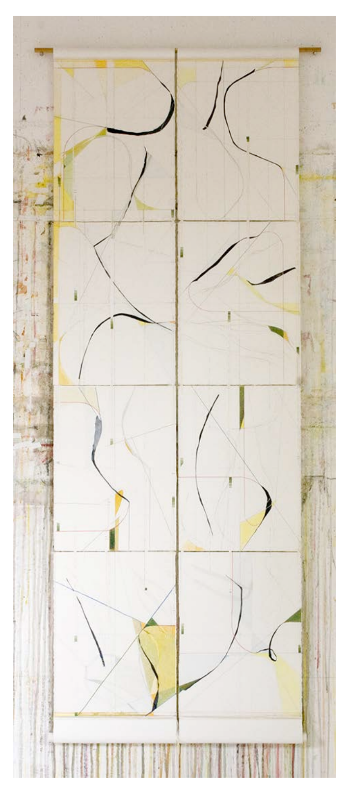
Sanda Iliescu and students, Leaves of Grass Ink and colored pencil on paper