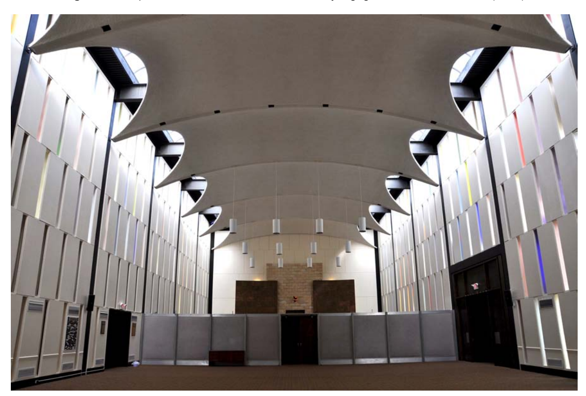
Figure 2: The Sanctuary, its seven section canopy ceiling, two skylights, and painted vertical slit windows