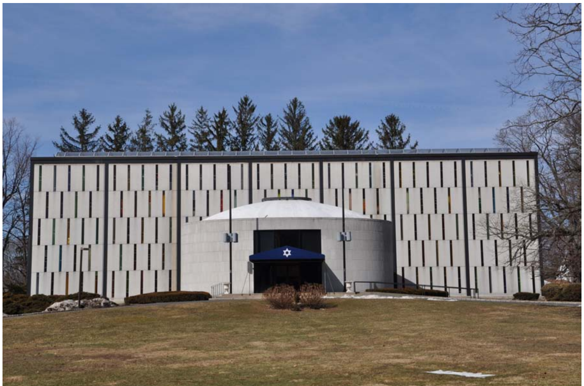
Figure 1: Philip Johnson's Kneses Tifereth Israel Synagogue in Port Chester, NY (1956)