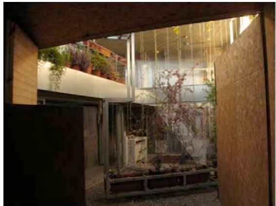
Figure 4 malleability of spaces