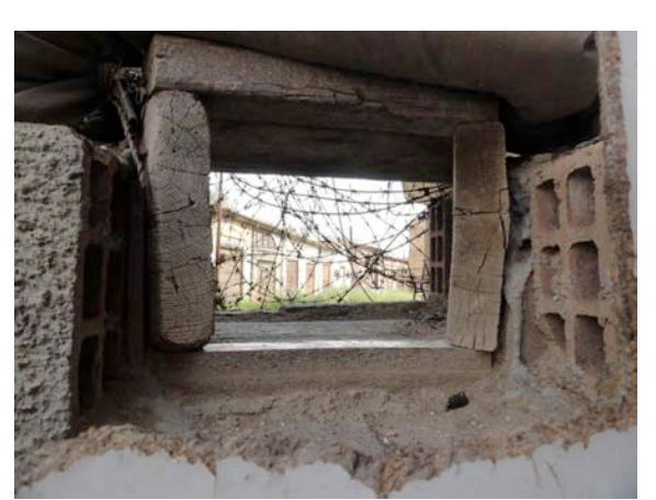
Figure 1 permeability into the Dead Zone

Vidler, Anthony. The Architectural Uncanny, essays in the modern unhomely (The MIT Press, 1992)