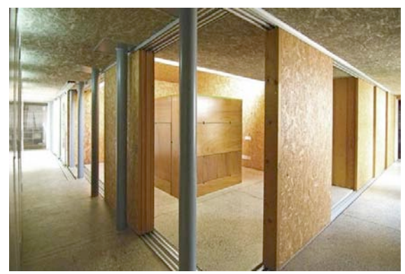
Figure 3 living in maximum flexibility