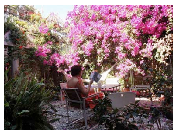
Figure 5 experiential oneness where subject and object are merged