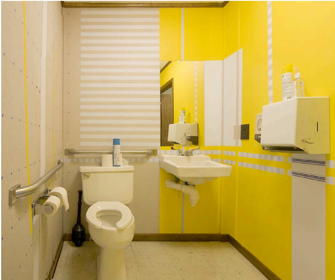
Contemplation and the Everyday: A Mural in a Public Bathroom