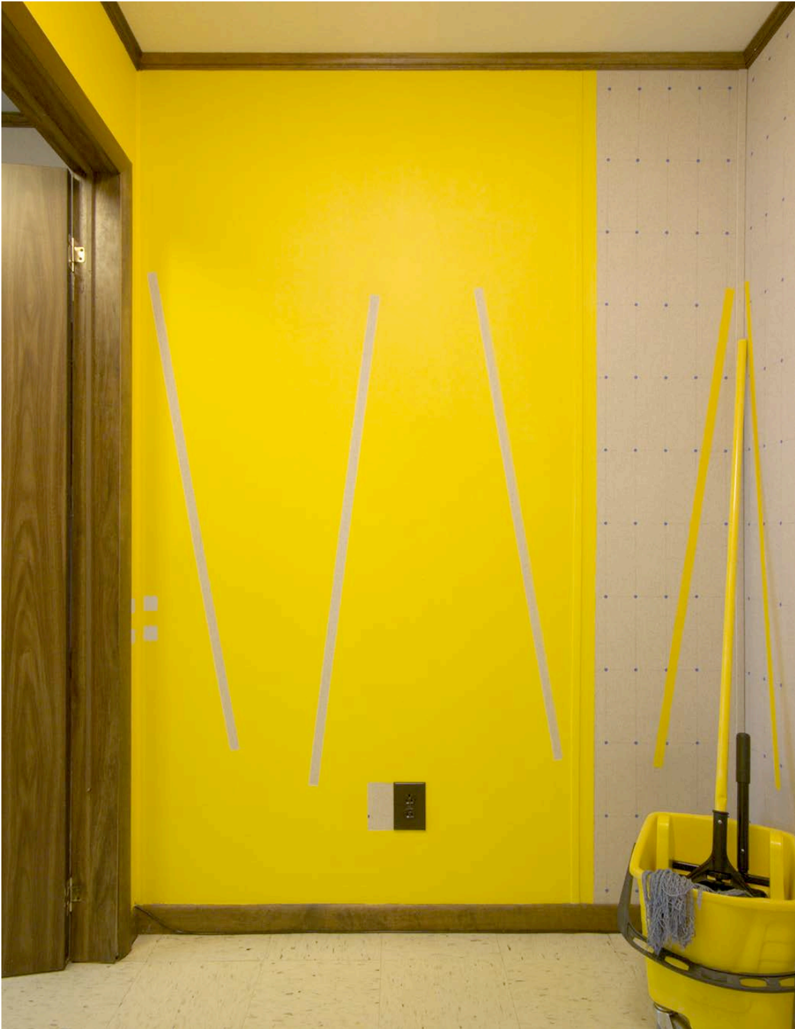
Contemplation and the Everyday: A Mural in a Public Bathroom