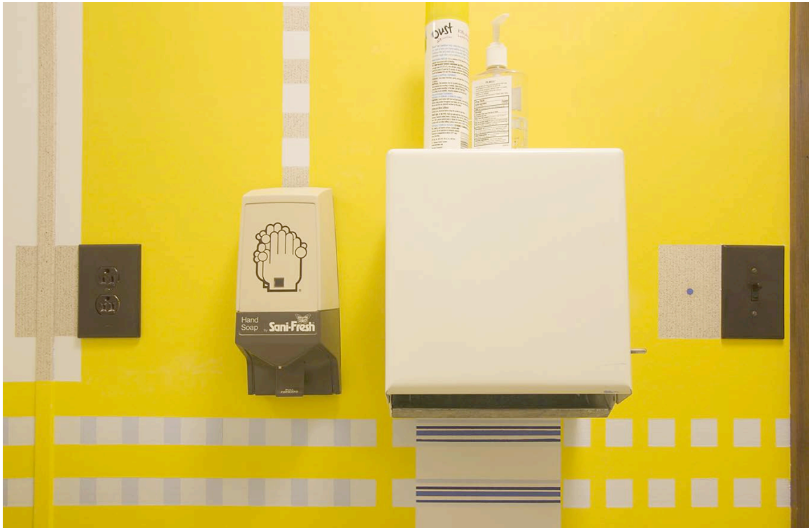
Contemplation and the Everyday: A Mural in a Public Bathroom