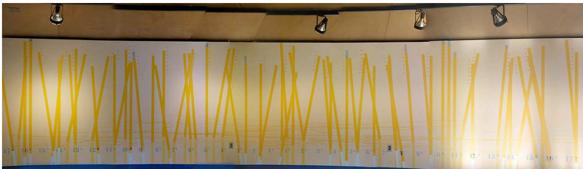
Extension of Bathroom Mural into a Public Hallway (design: author; execution: students & author)