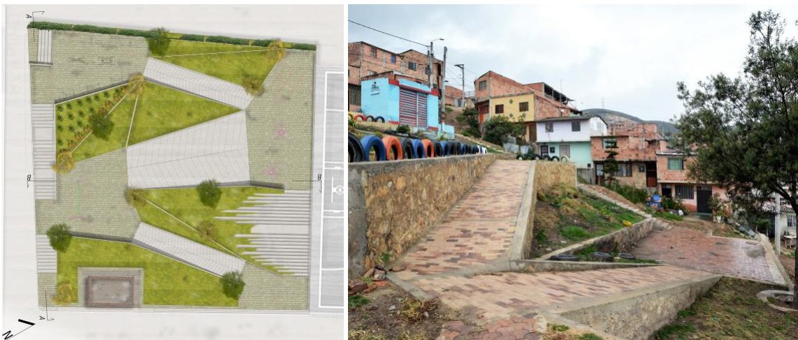
Image on the left is a rendered plan of park and was developed with my students at UPC after several meetings with the community. Image on the right is a photograph of the park in development.

The first case study is being developed with a community in the periphery of Bogota. One particular example with them is the work of co-creation being done on a lot that had become a deposit for demolition waste. Before actually starting to think about landscape architecture, the challenge was to activate the community and to catalyze discussion and action. Several years of workshops with inhabitants of every age group helped change the paradigm of what it means to be an empowered citizen. Interaction with local authorities has led to mixed results which has meant that the inhabitants have assumed active roles in the planning and construction of public space. Thus the park shown here became a project that was designed and built with the San Rafael neighborhood in Cazuca.