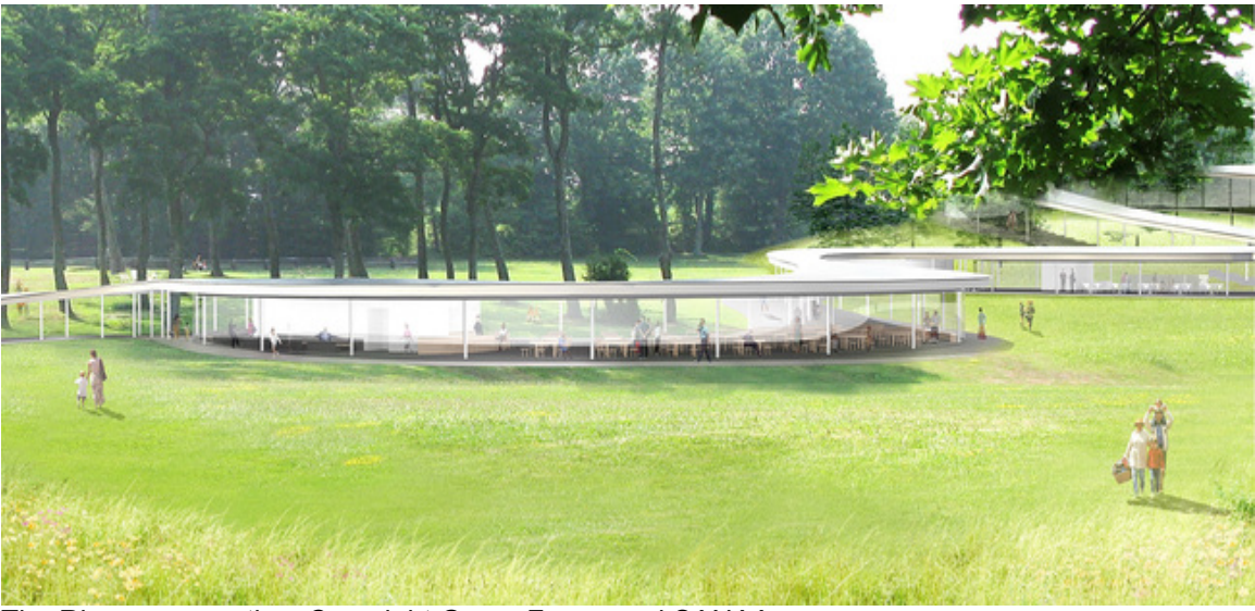
The River, perspective.