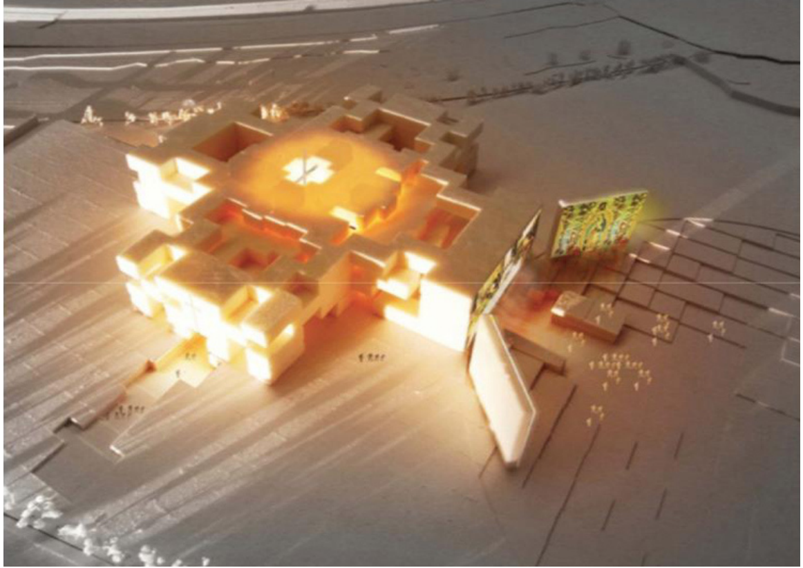
El Punto, model. Copyright Herzog & de Meuron and Arquine.