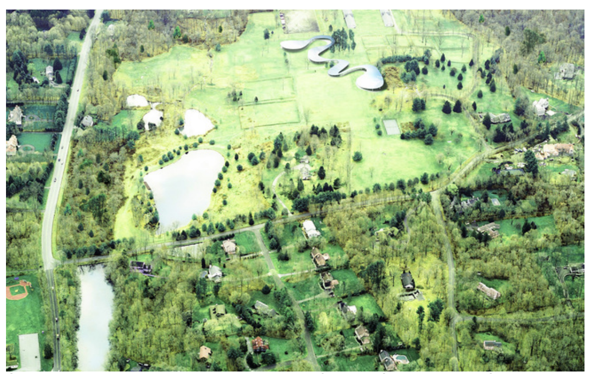
Grace Farms, aerial view, showing The River at top. Copyright Grace Farms and SANAA.

becomes a mode of experience that one appropriates to one's own need—a consummation of Benjamin's observation that capitalism—whose essence is consumption—can "satisfy the same worries, anguish, and disquiet formerly answered by so-called religion."