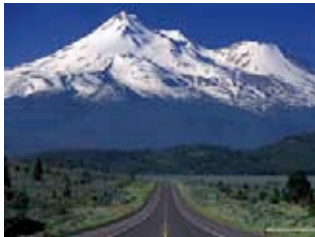
Mt. Shasta , Calif.

Denali, Alaska - Also known as Mount McKinley, is the highest peak in North America and holds great significance within the native traditions. "Denali" is translated as "the great one" in the Athabaskan languages of the Alaska Natives. 6