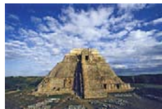
Uxmal – Yucatan, Mexico