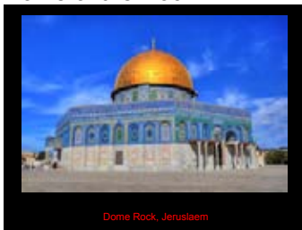
Dome Rock, Jerusalem