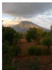
Mt. Agung, Bali