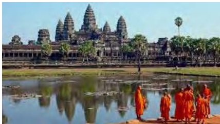
Angkor wat , Cambodia

As the birthplace of Muhammad and the site of Muhammad’s first revelation of the Quran, Mecca is regarded as the holiest city in the religion of Islam, and a pilgrimage to it known as the Hajj is obligatory for all able Muslims. 10