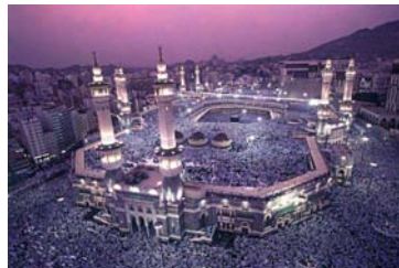
Mecca, Saudi Arabia