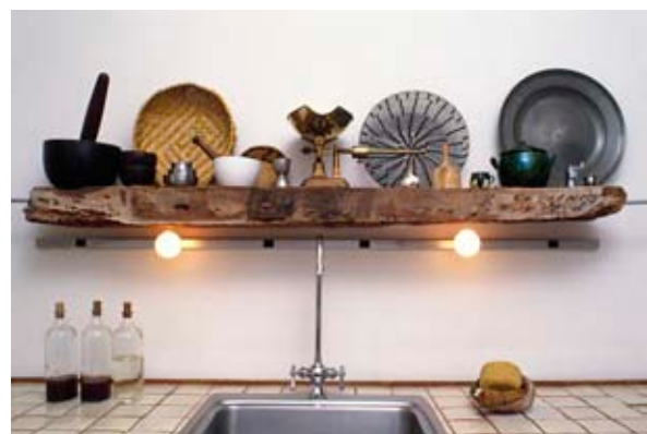
Judith Chafee Home + Studio Interior, Tucson, Arizona circa 1970.

Judith Chafee placed her architecture office in the adobe facing North Court Avenue and her private residence in the far western wing. Client meetings and office lunches were held in the dining area adjacent to the courtyard, which was created by removing the roof over one of the former residences. The public / private intersection takes place in the liminal space of the conference / dining area. An asymmetrical opening was carved in the earthen wall of the studio and passage allowed for body movement through the wall. The battered and staggered threshold provided logical support for the roof structural above, gracious procession for the body and exposed the time-tested earthen core.