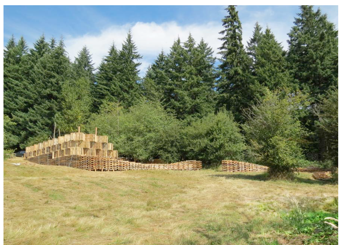
Diversion Design-build, 2014 Pickathon Music Festival, Happy Valley, Oregon (Travis Bell & Clive Knights)

With reference to a recently implemented festival structure as example, the session will ponder the relevance of placing figuration at the helm of the architectural enterprise, supported by the expediencies of economy, program and technique, as opposed to being led by them.