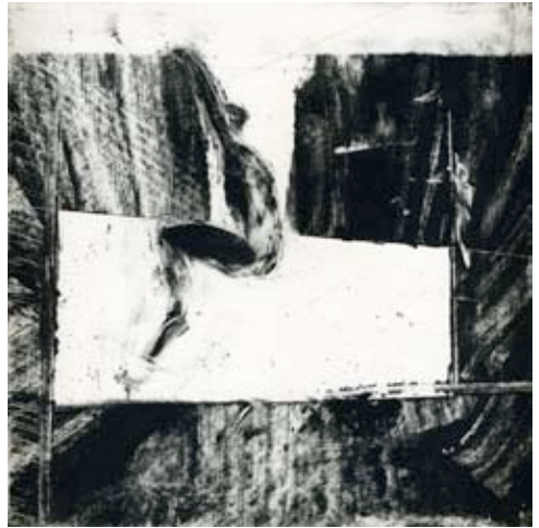
Borne, monotype, 2010, by Clive Knights

"Matter, conquered or deformed in the utensil, recovers its splendor in the work of art. The poetic operation is the reverse of technical manipulation. Thanks to the former, matter reconquers its nature: color is more color, sound is completely sound. In poetic creation there is no victory over matter or over the instruments, as the vain aesthetics of artisans wishes, but a setting free of matter.... Without ceasing to be tools of meaning and communication, they turn into 'something else'. That change – unlike what happens in technology – does not consist in an abandonment of their original nature, but in a return to it. To be 'something else' means to be the 'same thing'..."