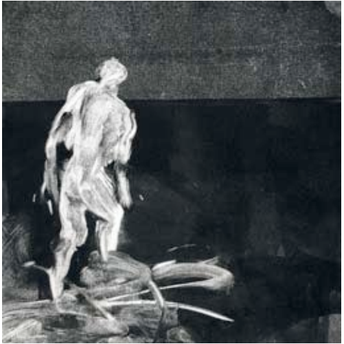
Wanderer, monotype, 2010, by Clive Knights

world is never fully accessible to us. Always to some extent opaque it can be grasped or represented only through its symbolic manifestations"<sup>8</sup>