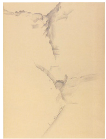
Fig. 3 Ghost Ranch Cliff

Is all this a delusion? Here, the Buddhist Compendium of Ways of Knowing questions the validity of objects that appear to consciousness.<sup>8</sup> Hence, Georgia O'Keeffe responded to her critics' fantasies, "My paintings erotic? No way! That's something people themselves put into them. When people read erotic symbols into my paintings they're really talking about their own affairs."<sup>9</sup> "Surely, you jest!" they snicker.