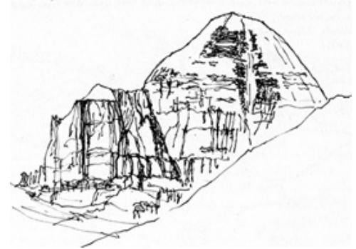
Fig. 2 Mt. Kailas

Georgia O'Keeffe's landscape paintings provide a platform for aesthetic departure. Sculpted contours surrounding V-shaped compositions; the unrestrained metaphysical passion of nature: Ghost Ranch Cliff and Waterfalls of Iao Valley provoke penetrating questions: 'Refined geological formations or "Outpouring of sexual juices, loamy hungers of the flesh;' as Lewis Mumford wrote, "One long, loud blast of sex."<sup>2</sup>