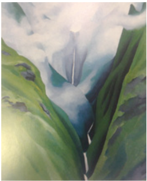
Fig. 4 Waterfall 3, Iao Valley