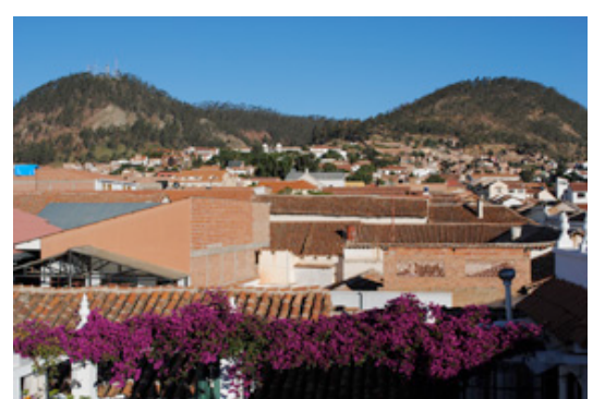
Fig. 1 Cerro Churequella Sucre

The sexually charged landscape is a multi-layered theme. Uniquely appearing as a distinct form in space, or distinct space surrounded by form, it invites attention to erotic shapes and spaces remarkably similar to human sexual organs. Caves like open vaginas, pairs of mountains spread to reveal shrub-like pubic hair or prominent breasts, and rock obelisks like enlarged penises. These landscapes charge spiritual practitioners and affect where peoples live. Primal cultures are drawn to these landscapes of raw sexual power, the play of male and female consorts of cosmic consciousness and the natural process.<sup>1</sup>